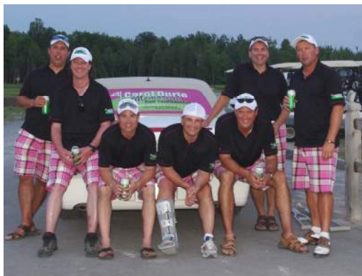
Carol Durie Memorial Golf Tournament has raised almost $200,000 over the past 3 years for the Mamography fund.

In 2013/2014 Special Events (including those in support of the Mammography Fund) raised over $261,618 for the KDH Foundation.