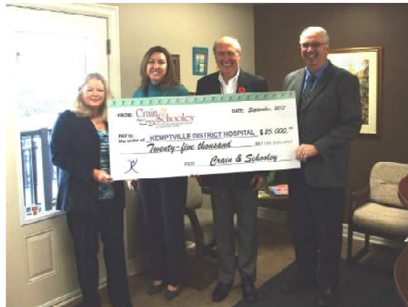
Crain & Schooley present a $25,000 cheque to KDH Foundation in honour of their 25 th anniversary in Kemptville

In 2013/2014 the Foundation received $252,565 in Major gifts and $71,260 in Planned Giving bequests.